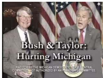
[PFB]: THE MICHIGAN DEMOCRATIC STATE CENTRAL COMMITTEE