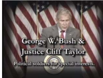
political views are for clear principles of the constitution