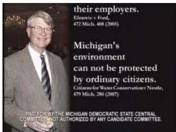
[Text on screen]: Bush & Taylor: Hurting Michigan.