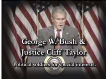
[George W. Bush]: "And, the best way to keep judges in Michigan from substituting their own

Brand: DEMOCRATIC ST CNTRL CMT (B339) Parent: PARENT UNKNOWN Aired: 10/30/2008 - 11/01/2008 Creative Id: 6820065