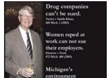
Michigan's environment cannot be protected by ordinary citizens.