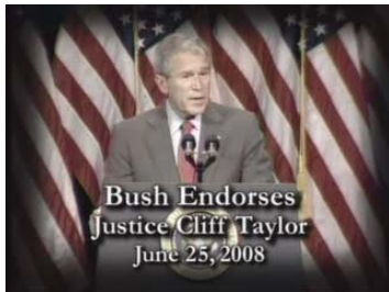
[Announcer]: Drug companies can't be sued.