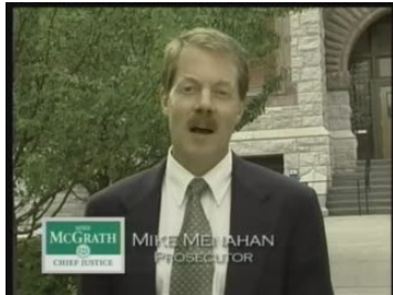
outstanding Chief Justice. He has solid common sense plans for making the