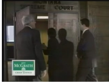
prosecutors and two terms as our attorney general."