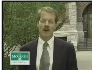
Supreme Court work better and a proven ability to make those changes once elected.